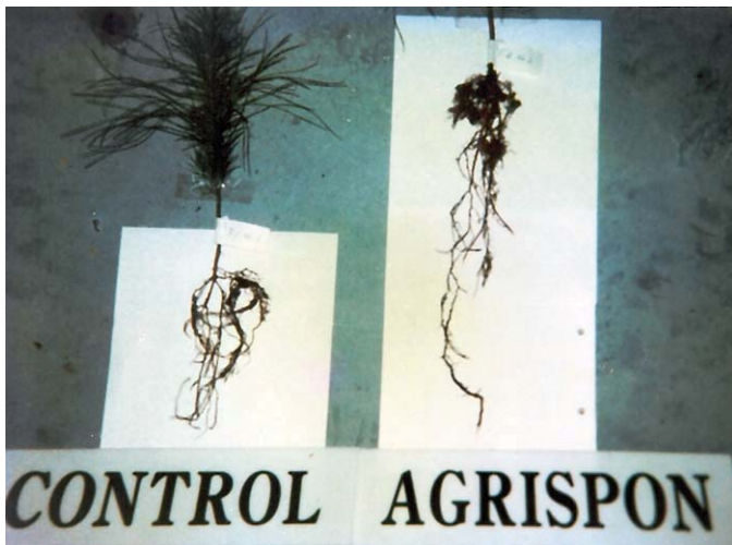
Rooting system of untreated and treated seedlings of P. caribaea