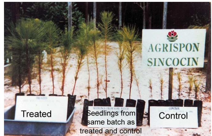
Note the difference between the treated and untreated seedlings.